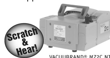
VACUUBRAND® MZ2C NT

Scratch the circle below, and you'll hear a sound just a little quieter than VACUUBRAND oil-free pumps in operation. These whisper-quiet, ultra-low maintenance pumps are welcome partners for lab use and OEM applications.