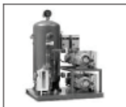
Central Source Vacuum System