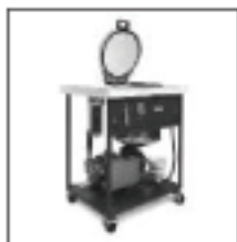
Vacuum Degassing Chambers